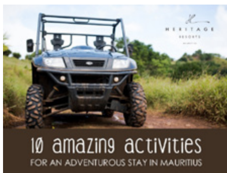
10 AMAZING ACTIVITIES FOR AN ADVENTUROUS STAY IN MAURITIUS