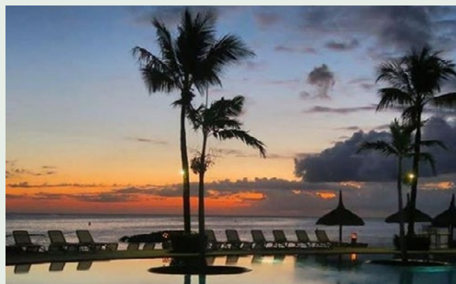
#HeritageResorts #HeritageAwali #Luxury #BeautifulDestinations #BeautifulHotels #CNTraveler #NatGeoTravel