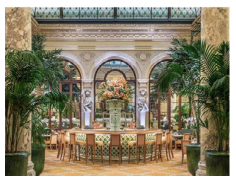
THE WORLD'S MOST LUXURIOUS HOTELS | HOUSE OF COCO