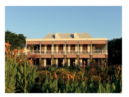
LUXURY WEDDING & HONEYMOONS | WTM AUTUMN 2018