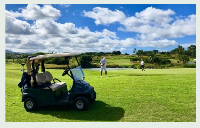
"The most important shot in golf is the next one." - Ben Hogan